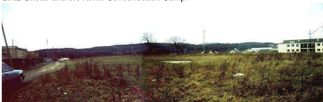
The old cemetery in 1989

In 1939 some estimates say that almost 4,000 Jews lived in Gostynin, though a more reliable number is 2,269. They suffered the same fate as thousands of other Jewish Communities during the Holocaust. When the German army entered the town in September 1939, there were mass arrests of Jews and Jewish property was looted and destroyed. The synagogue, which had been rebuilt in 1899 after a fire, was ordered dismantled so that the wood could be used for fuel for the houses of new German inhabitants of the town. Exorbitant fines were levied by the Nazis against the Jewish Community. In January 1941 a Ghetto was set up and approximately 3,500 Jews from Gostynin and the nearby town of Gabin (Gombin) were forced to live in the Gostynin Ghetto and were employed in laundering and tailoring workshops. From August 1941 many people were gradually moved to the Konin Concentration Camp. Sources report that the Ghetto was liquidated on April 16-17, 1942 with 2,000 Jews being taken to the Chelmno death camp. However some were probably taken to the Łódź Ghetto and the Konin Concentration Camp.