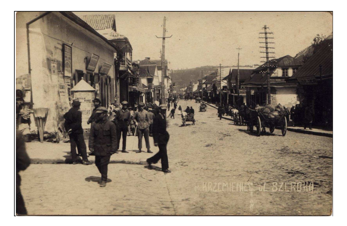
Szeroka (Broad) Street, Kremenets, 1929